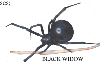
BLACK WIDOW

The female black widow is jet black with a red hourglass shaped marking on the underside of the abdomen. Black widows live in undisturbed locations such as woodpiles; dark corners of barns, garages, and houses; and under boards and rocks. They also like to make their homes in crawlspaces, cellars, basements, and outhouses.